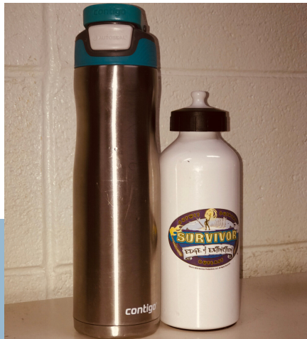
Metal Water bottles