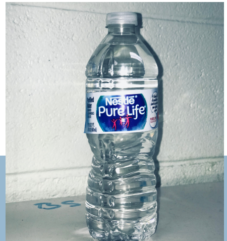
Plastic Disposable Water bottles