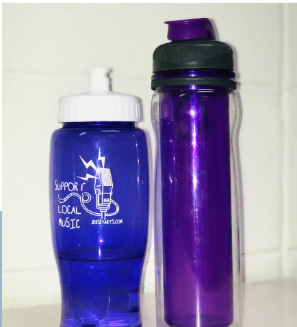
Plastic Reusable Water bottles